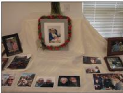
A collection of family photos anchors a memento display.