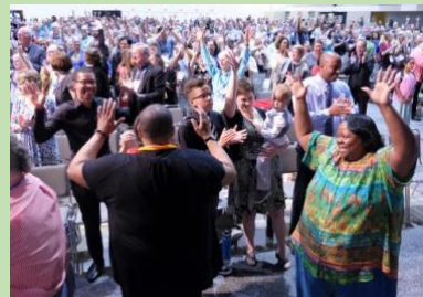
Sunday Morning Worship at the 2018 GA in Kansas City, MO.