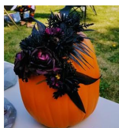
End result - gorgeous