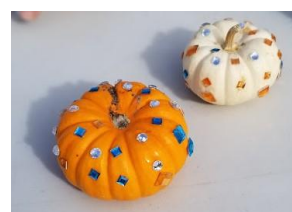
Sandy Goodwick - jeweled pumpkins