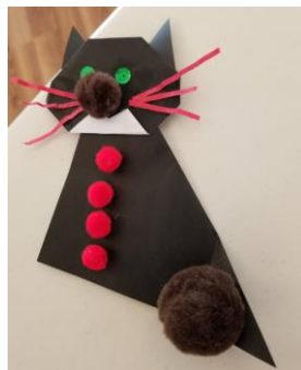
Of course Pat Dusel made a purr-fect cat