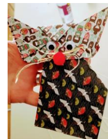
LauraLee's Kombucha is holding this poor cat up We all need help at times !