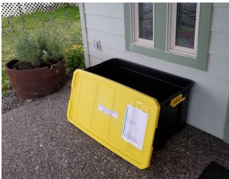
We need to fill the donation box located on the Fellowship porch

We need your help to sustain our efforts through the cold winter months! The LFP team has done amazing work, with members donating substantial amounts of their own money. Members of the congregation have contributed food and money. But this is not enough to make the Pantry an on-going success. It will take all of us getting involved.