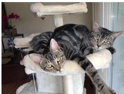
Tiglet and Tigeroni following LauraLee's rigor of relaxing and healing