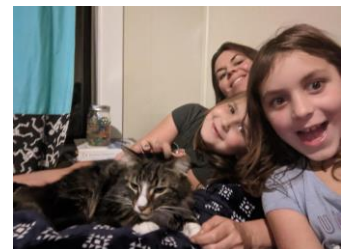
Moose Buggy !