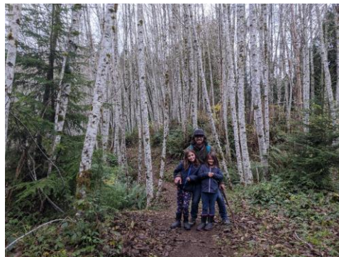
The Buggy's family walk to the mouth of the Lyre River