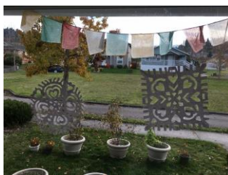
Unique shapes like snowflakes from Harmony Rutter