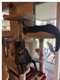
Tigeroni & Tiglet Cat Social Distancing