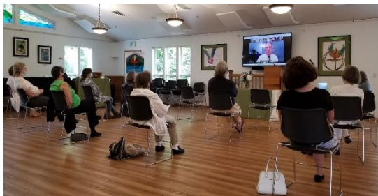
“families may sit together”

We invite and welcome persons who would like to join our Zoom Sunday service at the Fellowship. The Zoom meeting will be projected onto the large TV screen for viewing with CLOSED CAPTIONS.