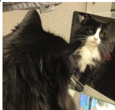
Sassy getting ready to supervise the bocci ball games

Some of us meet at the Carrie Blake Park in Sequim on Monday afternoons at 2:00 pm to play bocci ball and shuffleboard. Don't worry if you don't know how to play these games. We are all having fun learning and trying to decide what rules to follow. We play for an hour or two. Free equipment is provided. Since the court area has no benches, you might want to bring your own outdoor chair. People not vaccinated need to practice social distancing.