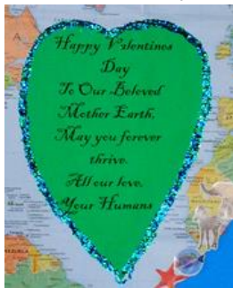
Display by anonymous

We invite and welcome persons who would like to join our Zoom Sunday service at the Fellowship. The Zoom meeting will be projected onto the large TV screen for viewing with CLOSED CAPTIONS.