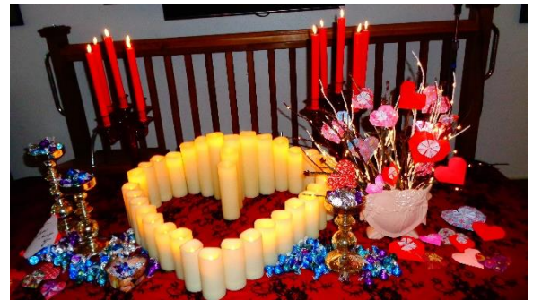
Arrangement by Ken Nielsen

Face masks covering nose and mouth must be worn during the service itself and no one should remove their masks to eat or drink. Persons participating in an after-service discussion have a choice to remove their masks to eat and drink.