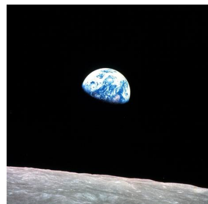
1968: When Apollo first orbited the moon and Saw the earth rise in space