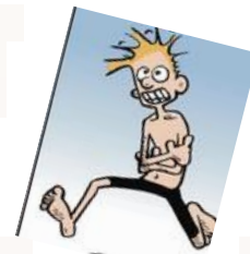
Frazz (cartoon character)

"Don't give up! Sometimes you have to suffer through DesMoines before you get to Boulder."