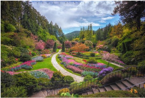
One part of the bountiful Butchart Gardens

Adventurers Group has added a 4th Friday and we're off to Butchart Gardens on May 26 . This is a day trip with the option to stay over for those wishing to do so. Contact the Black Ball Ferry for a day trip ticket package . Each person is responsible for securing their own ticket package. Round trip ferry/Butchart admission and round trip shuttle package from downtown Victoria to Butchart and back is $108.50. Walk-ons must arrive Port Angeles by 7:50am. Return trip, walk-ons must board ferry in Victoria by 7pm. Arrives in Port Angeles at 9pm. A few of us will be spending the day sightseeing in Victoria, but most of us will be visiting the gardens.